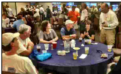
Crews review the races at the party.